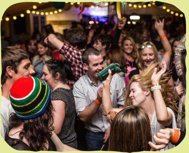
The Doolin Folk Festival takes place annually in June