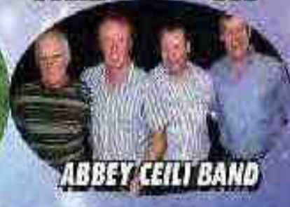
ABBEY CEILI BAND